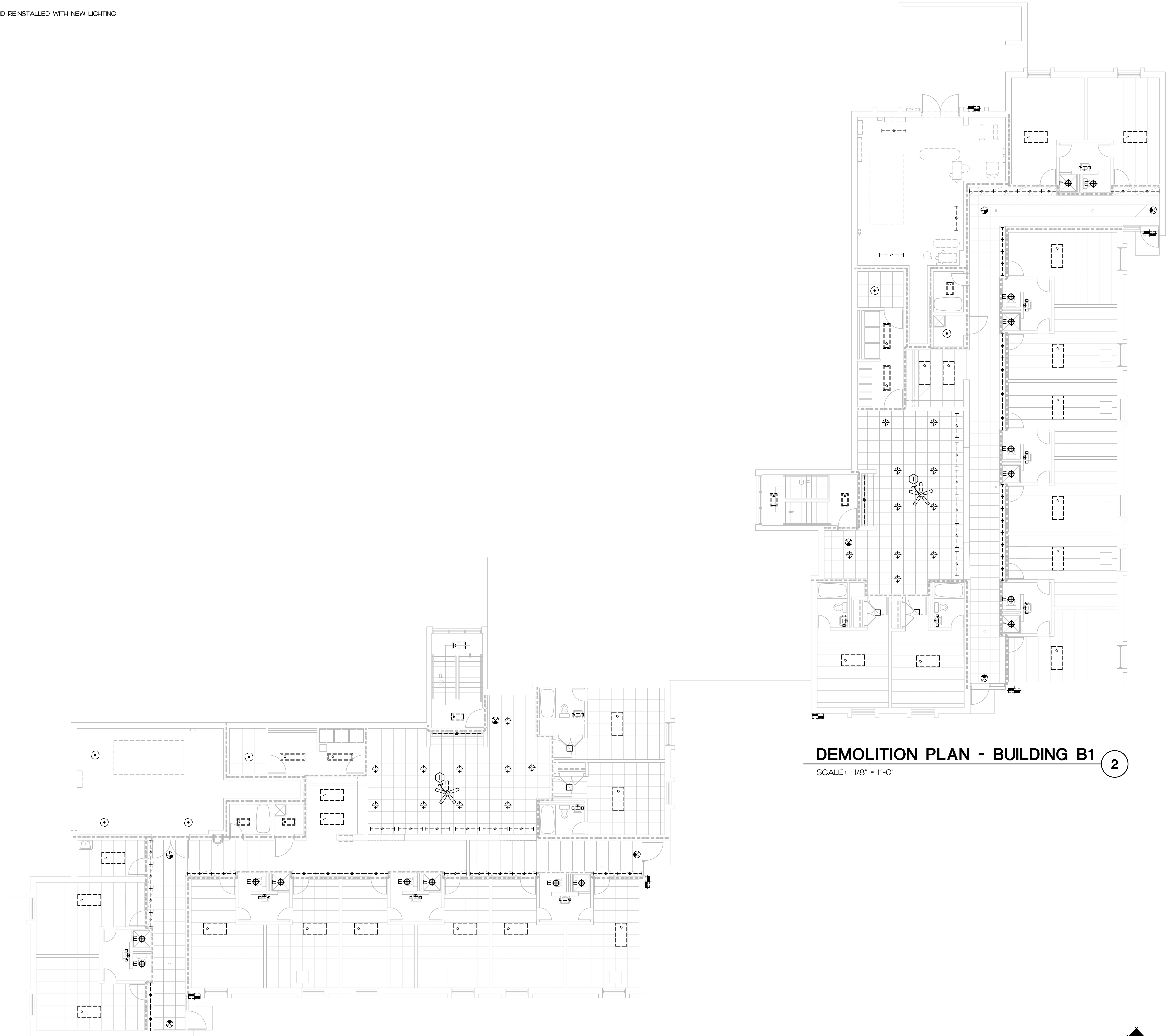
DEMOLITION PLAN - BUILDING A1

⬠ EXISTING FAN TO BE REMOVED AND REINSTALLED WITH NEW LIGHTING